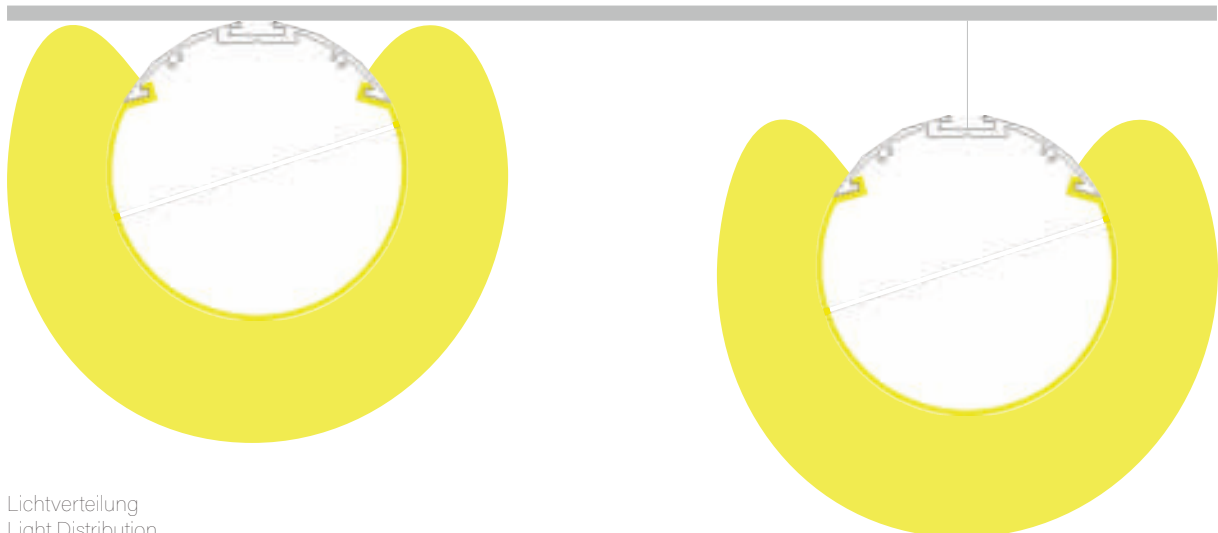
Lichtverteilung Light Distribution